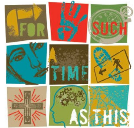
PRESBYTERIAN YOUTH TRIENNIUM 2010

They will be commissioned during our Presbytery meeting at Rahway First on Tuesday, June 22. Please join us in praying for them.