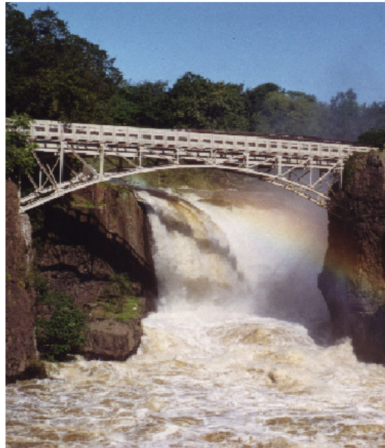
Great Falls of the Passaic, Paterson NJ

Religious leaders and members of churches have a responsibility to address this eco-justice issue of clean water for all.